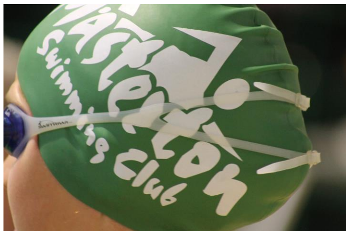
Masterton Swim Club Cap

Swimming Wellington will provide a full set of Annual Accounts prior to, or on the 7 September 2016