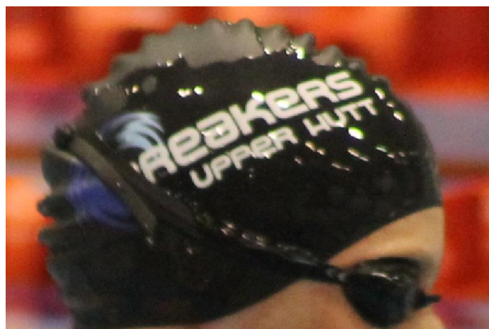
Breakers Swim Club Cap