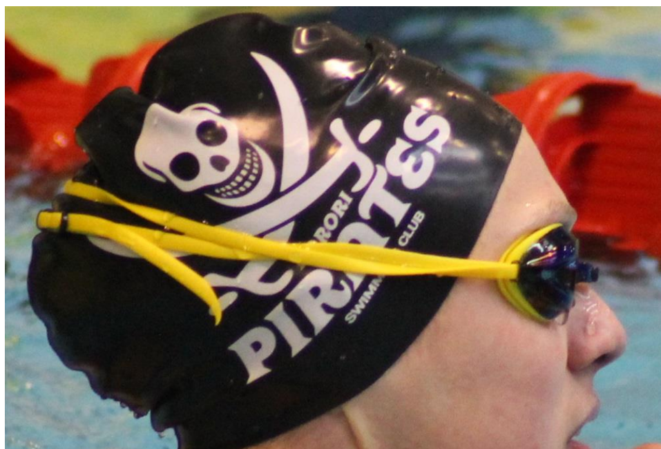
Karori Club Cap