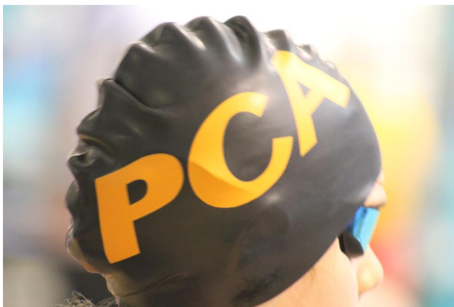
Porirua City Aquatic Club Cap