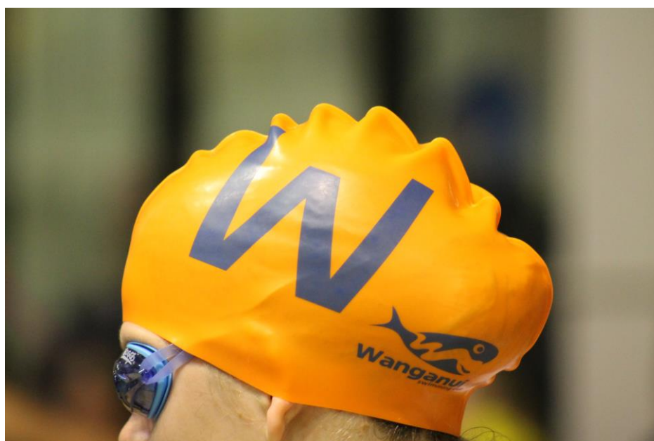
Wanganui Swim Club Cap