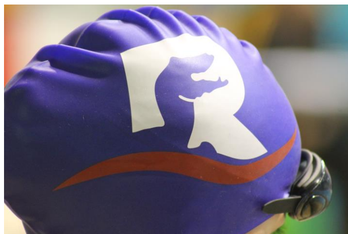
Raumati Swim Club Cap