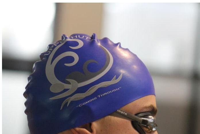
Upper Hutt Swim Club Cap