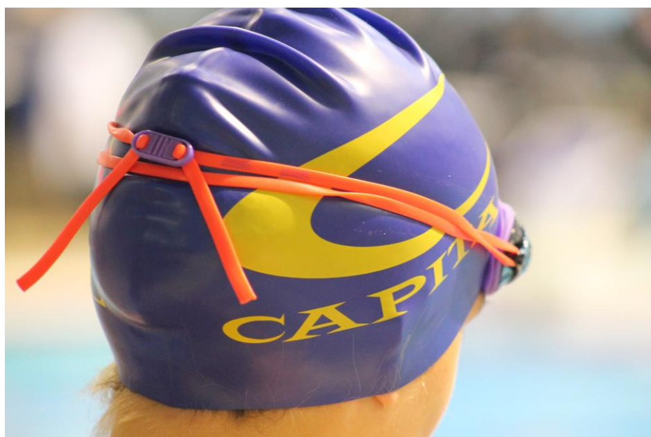
Capital Club Cap