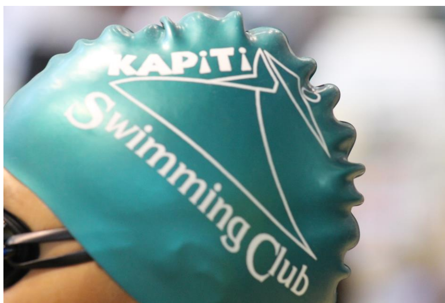
Kapiti Club Cap