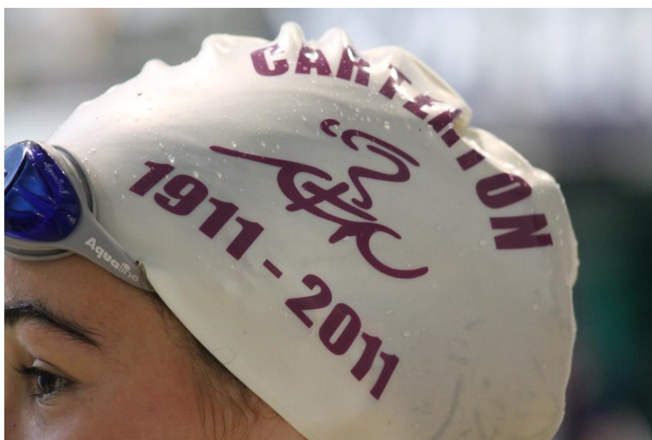
Carterton Club Cap