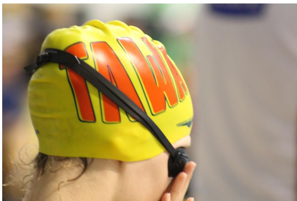
Tawa Swim Club Cap