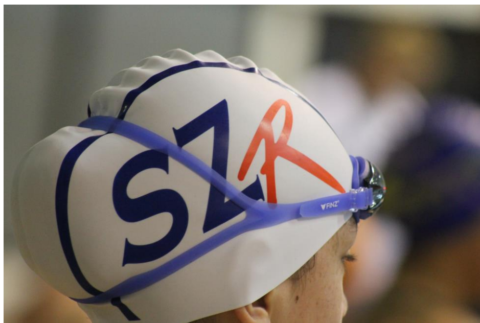
SwimZone Club Cap